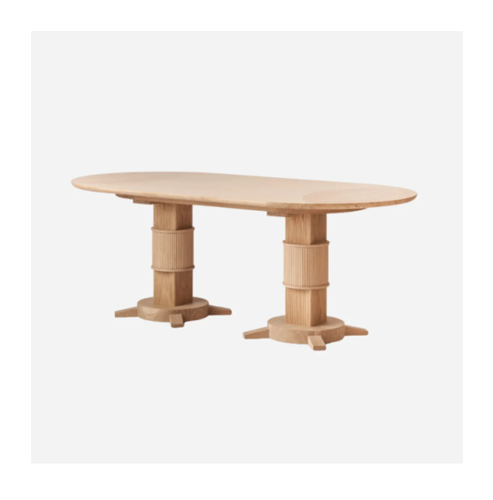
Noughts and Crosses Dining Table