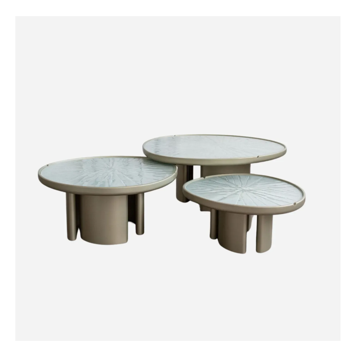
Water Lily Tables