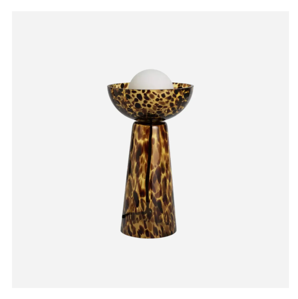
Habitat Tortoise Shell Glass Table Lamp