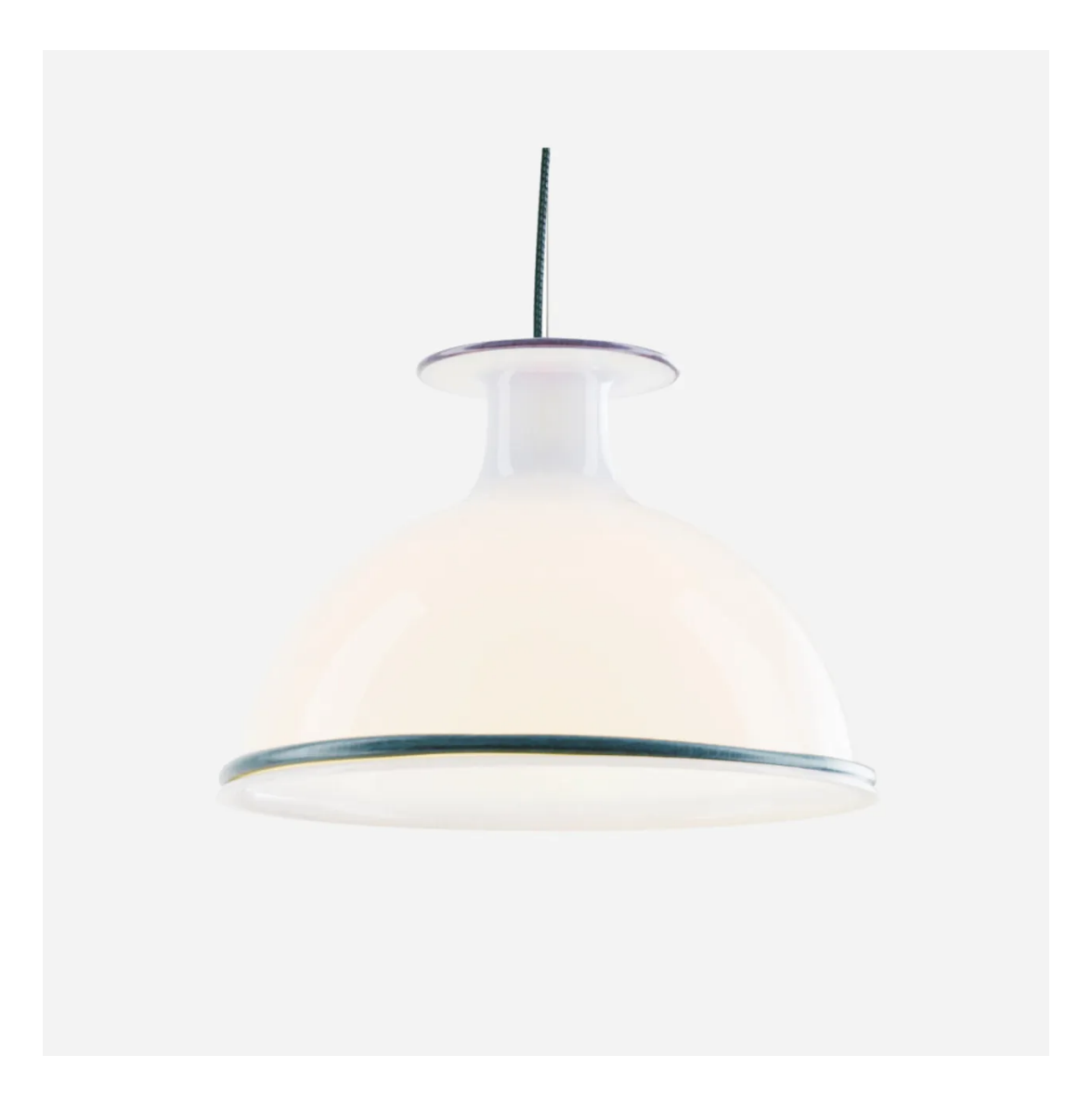
Mark Pendant Light, Established & Sons

Simple furniture with gentle curves is the starting point for a calm scheme. However, some life and energy can come into play with sketchy, botanical textiles and embroidered embellishments.