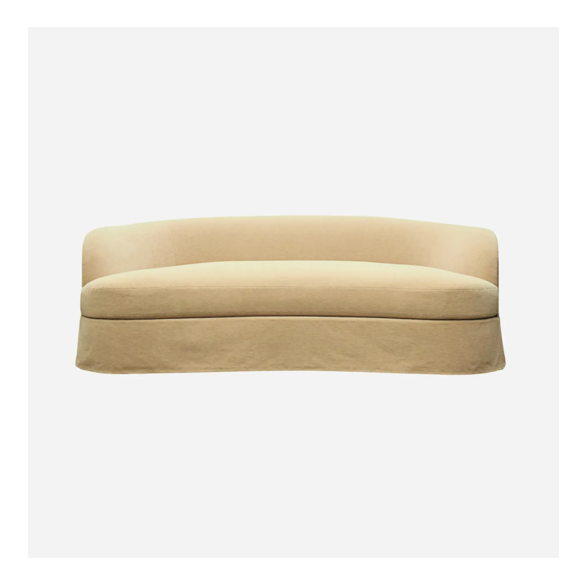
Tor Tailored Sofa, in 'Marci' Mohair