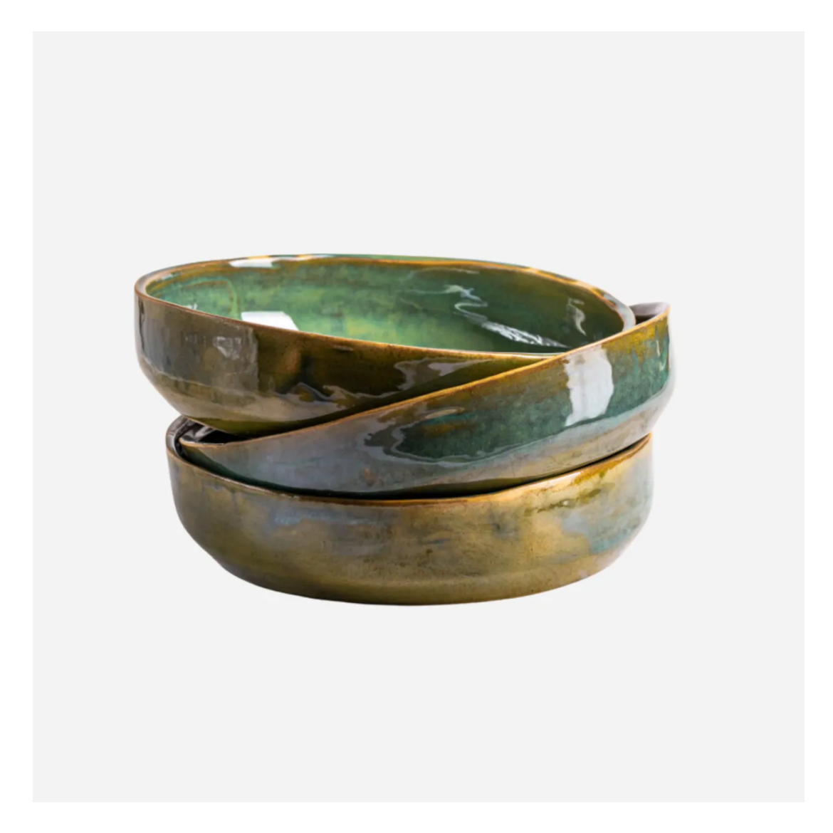
Millfield Serving Bowl