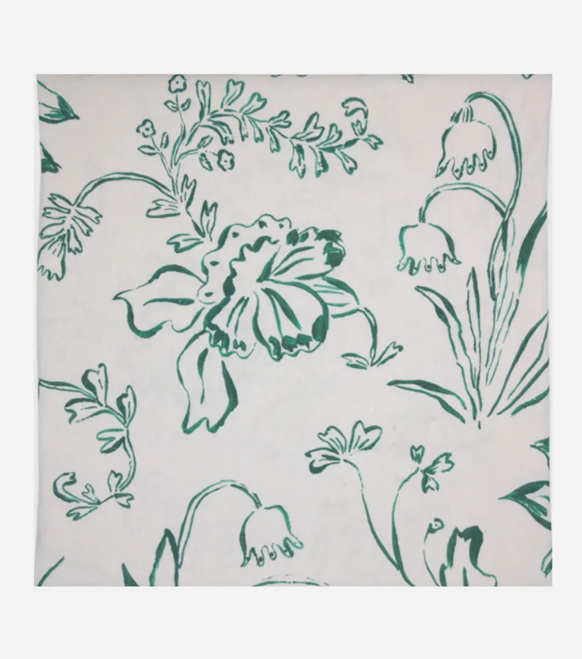
Botanical Print Green & Cream Tablecloth