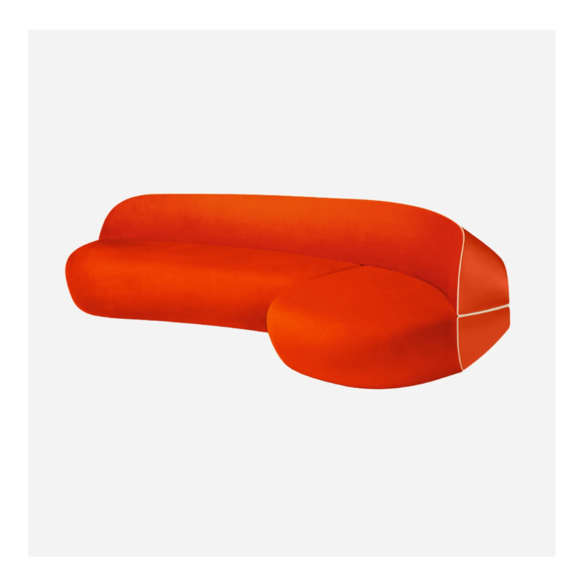
Binda Sofa By Raw Edges

Tortoiseshell, bamboo, tan and green are a classic combination, but given a contemporary twist by modern forms and fluid upholstery. This amazing wall light by Natalia Triantafylli combines traditional hand-built ceramics with 3d-printed elements.