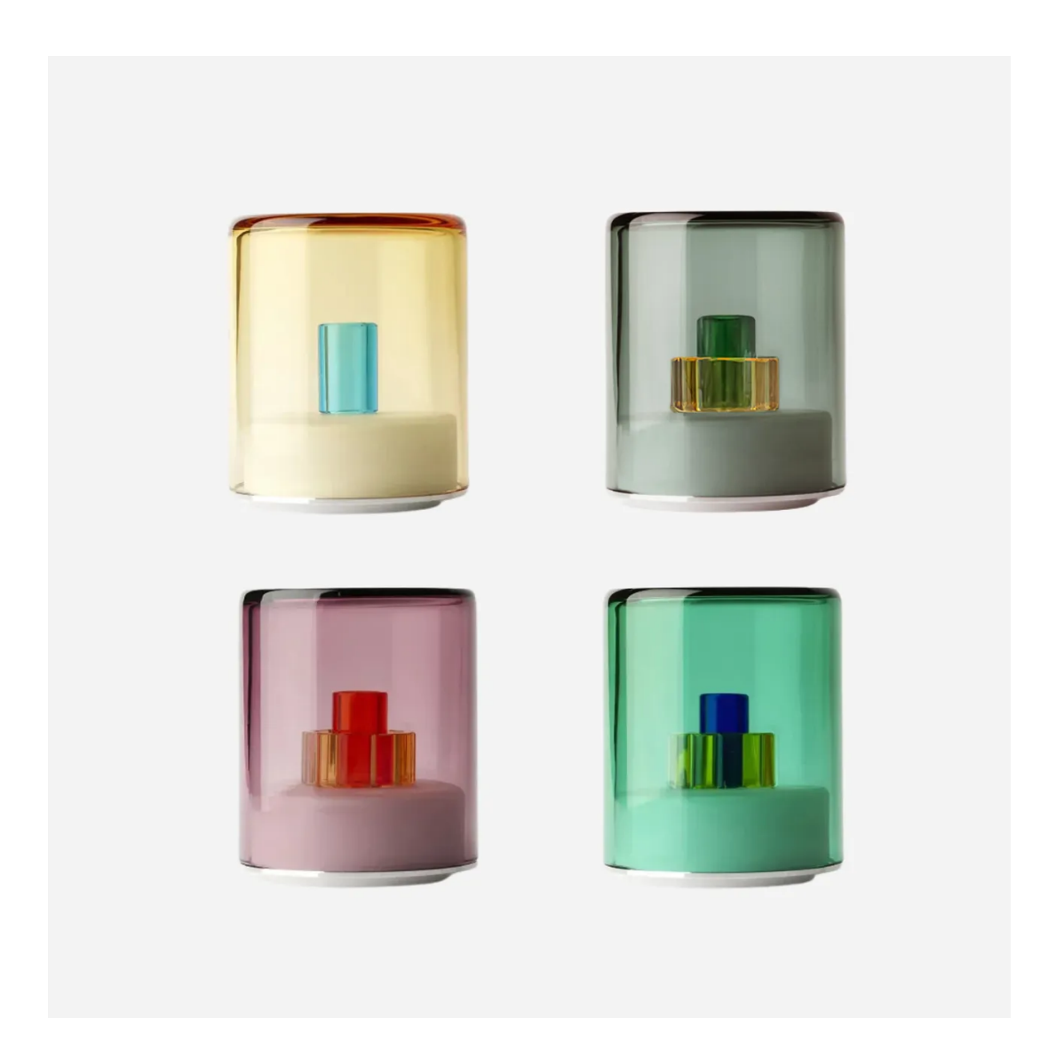
Cordless Table Lamps