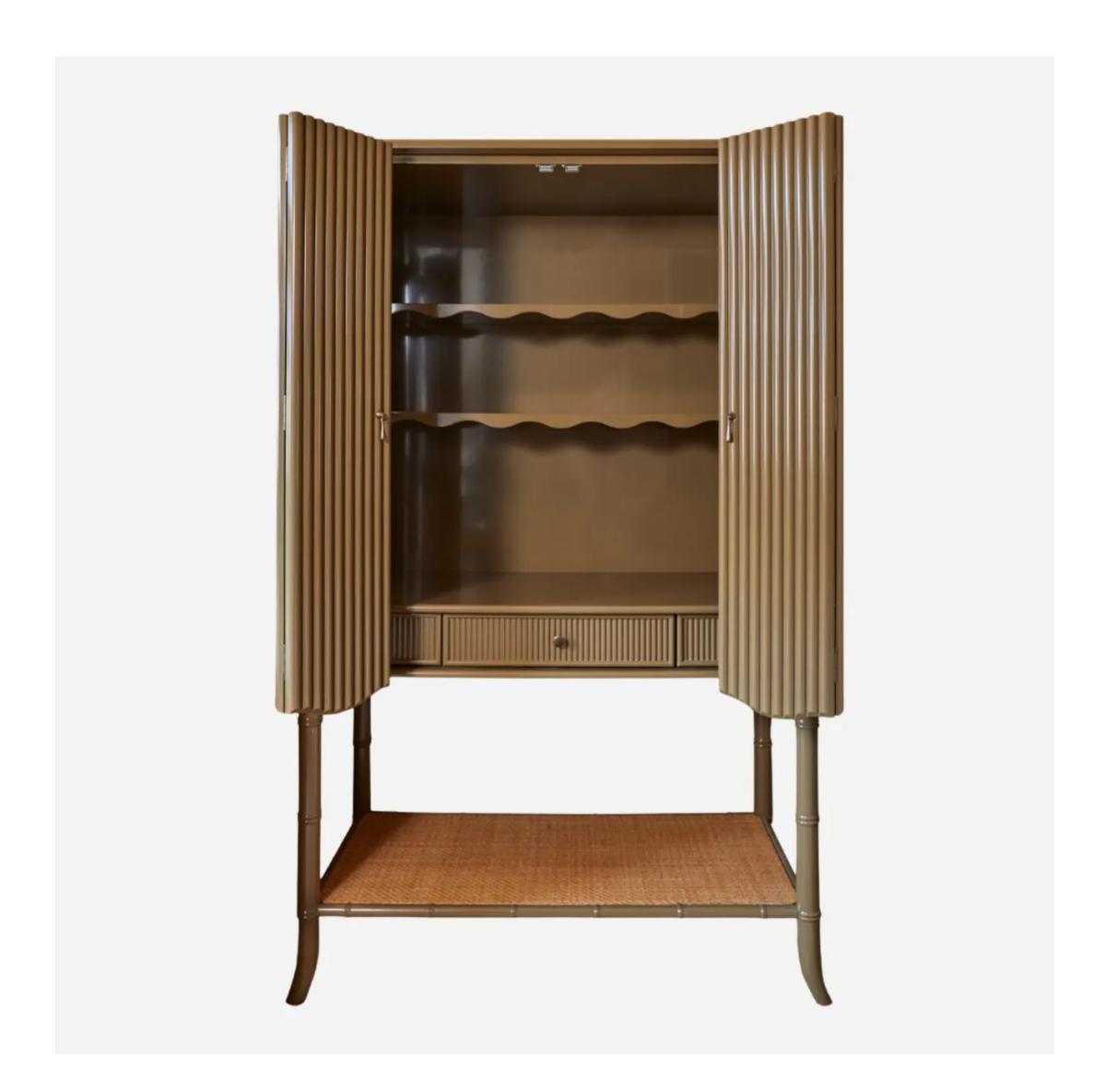
Avalon Bar Cabinet