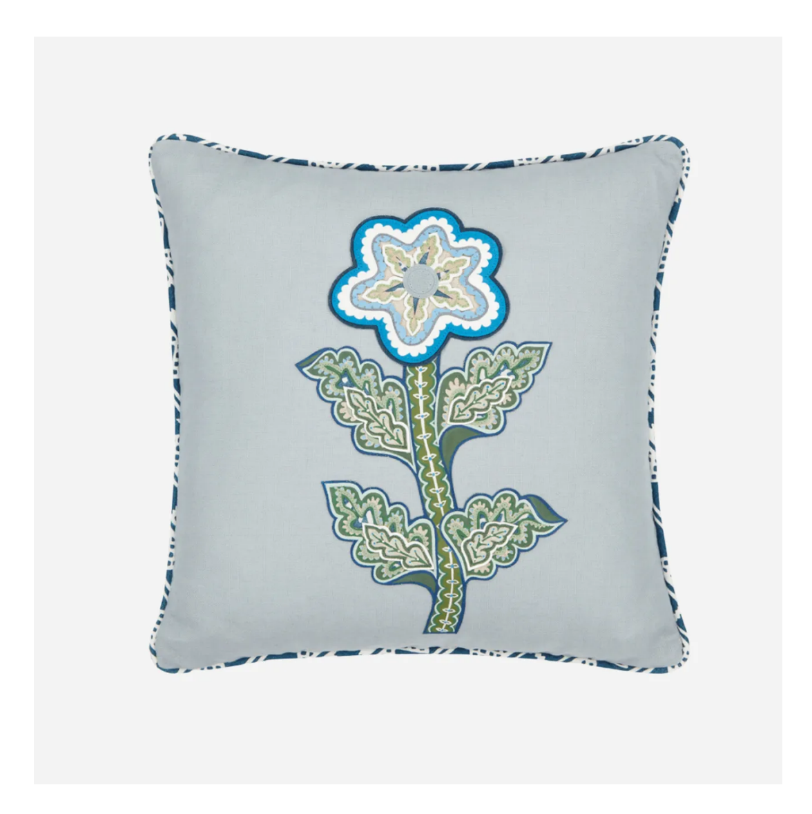
Vasilisa Appliqué Parma Grey Cushion