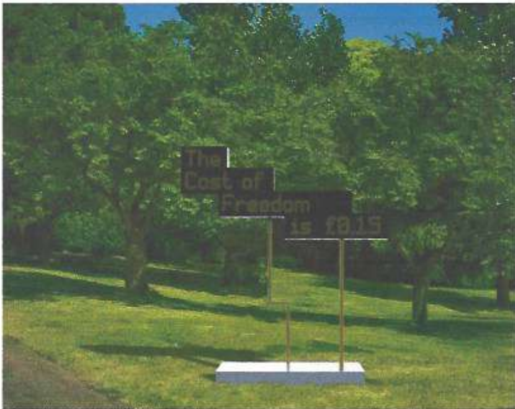
Fabio Lattanzi Antinori, 'AD KEYWORDS' (2020), will be on display at Frieze Sculpture in Regent's Park

"Hybrid" is the word of the month. Frieze itself isn't totally digital — its Sculpture Park is happily back in Regent's Park and organisers will host the Frieze Live performance programme in a temporary space on Cork Street (both from October 5). Siddall believes the fair also has a role to play in encouraging visitors to the many other real-life events taking place during the week. The VIP pages of Frieze's website include an "In the City" section with listings of private views and museum shows, as well as promoting the 1-54 African Art Fair that fields 29 exhibitors in Somerset House from October 8-10.